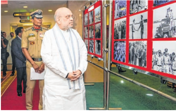
Amit Shah during the BSF Investiture Ceremony 2025 in New Delhi on Friday

Shah also noted how India's response to terrorism from across the borders has changed during under the Narendra Modi government.